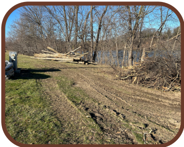
Clearing invasive trees at Phoenix Lake