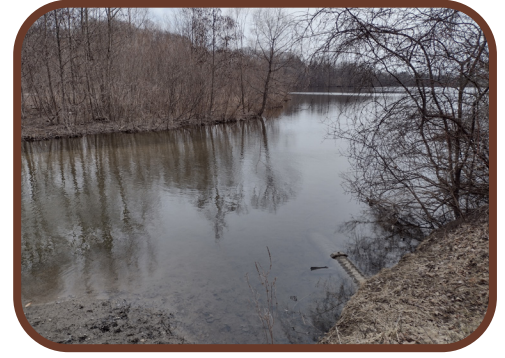
Existing conditions at Phoenix Lake