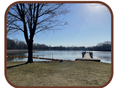
Turbidity controls in place at Wilcox Lake