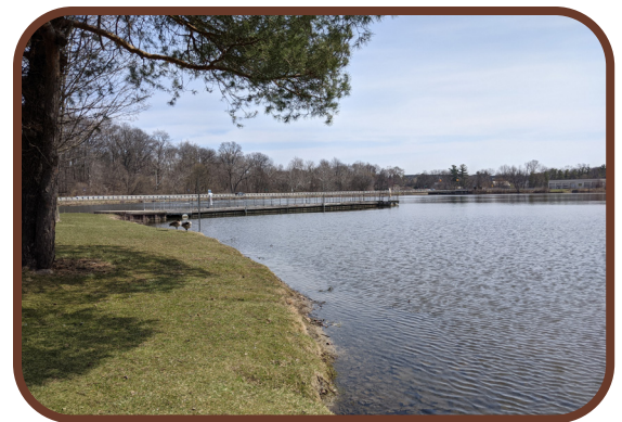
Existing conditions at Wilcox Lake