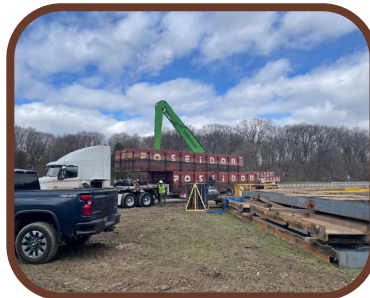
Delivery of barges at Wilcox Lake