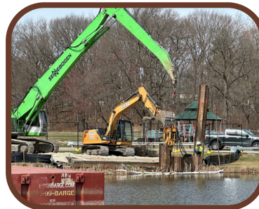
Installing transfer dock at Wilcox Lake